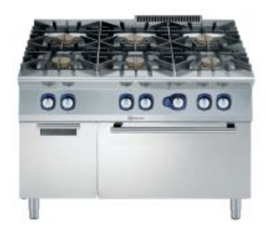
6-burner gas range on gas oven with cupboard