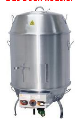
Gas Duck Roaster