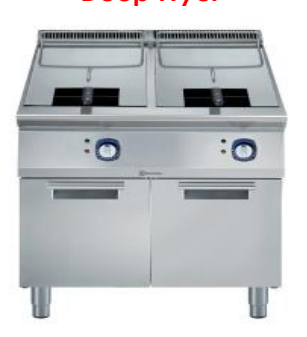
15+15 Lt Electric Deep Fryer