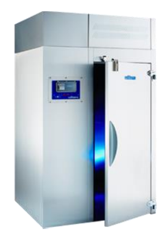
Roll-in Blast Freezer